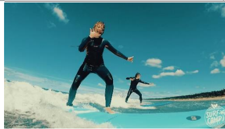
Other activities and StuVac