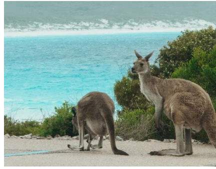
Australian Wildlife and Nature