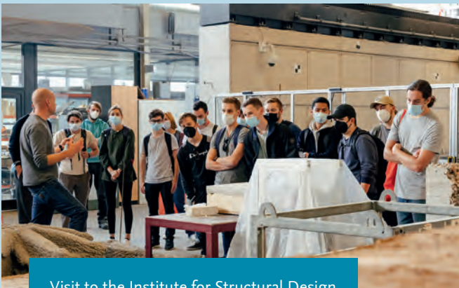
Visit to the Institute for Structural Design