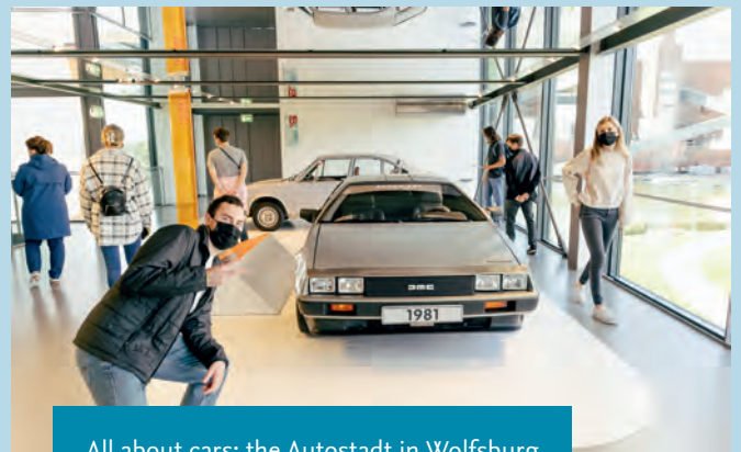
All about cars: the Autostadt in Wolfsburg