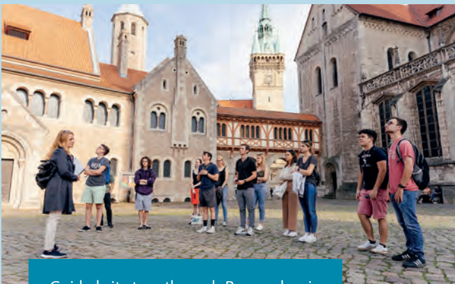
Guided city tour through Braunschweig