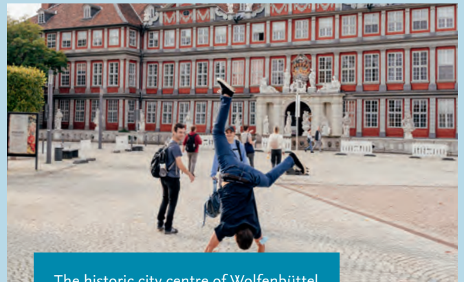
The historic city centre of Wolfenbüttel