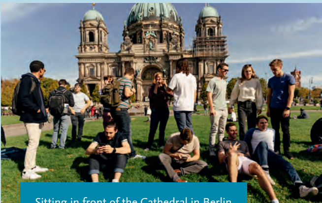
Sitting in front of the Cathedral in Berlin