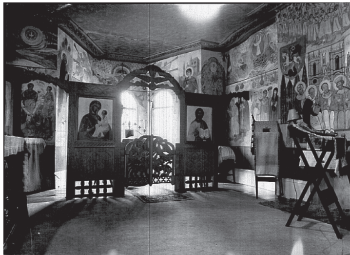
Chapel in St Basil's House of the Fellowship of St Alban and St Sergius in Ladbroke Grove, London, 1946