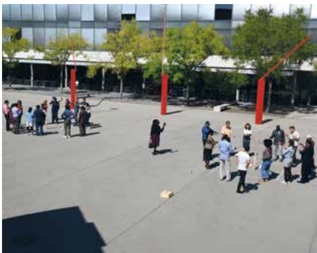
Tower of Power: Team-building exercise on conflict resolution – Summer University 2018

As regards the Swiss Centre of Expertise in Human Rights – the institutional future of which remains in doubt – activities in 2018 were dominated by two subjects: the basic rights of the elderly and the 'Self-Determination Initiative' referendum. The International Section continued to explore the theoretical and import of the first subject and published several papers. As regards the referendum, activities primarily took the form of participation in panel discussions. An event exploring the topic of human rights and religion provided a fitting opportunity to honour the 70th anniversary of the Universal Declaration of Human Rights.