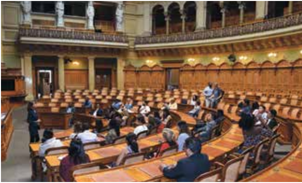
Visit of the Federal Parliament – Summer University 2018

not waned; they have increased, sharply. Among the most protracted and devastating are civil wars and other forms of domestic armed conflict which fall short of all-out war. Behind these confrontations are often disagreements about the sharing of power and resources and the peaceful co-existence of people of different religious beliefs, language or culture, as well as the form of government that the states involved should adopt. In certain contexts, the use of the word federalism should be avoided because it is an alien or loaded idea. What it actually means is formerly disadvantaged or oppressed regions and communities demanding and expecting their own laws, governments and budgets, as well as the possibility of being able to play their part when laws, governments and budgets are made that take into account all sections of the population. When selecting Summer University attendees, the IFF factors in the interests of those countries seeking to hone their federalism-related expertise. This is why it chose applicants from Ethiopia, Iran, Myanmar, Nepal, the Philippines, Somalia, Sri Lanka and Syria to attend the course.