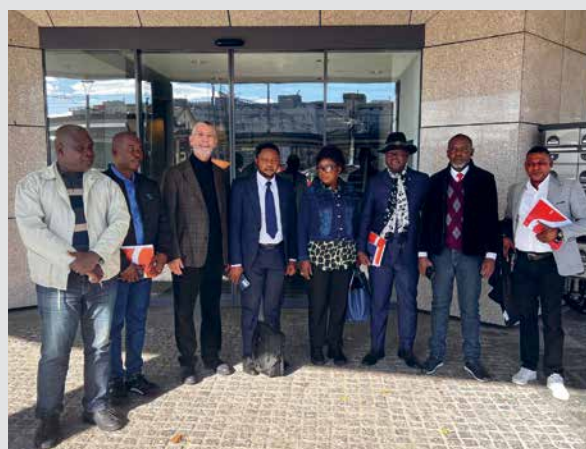
Visit members of the general secretariat of decentralization DR of Congo, October 2024

On behalf of the Department of Justice of the Canton of Uri, the Institute analysed the legal validity of the popular initiative « Isleten for all ». This initiative called for the enactment of a legal utilisation regulation for the Isleten area on the western shore of Lake Lucerne. The expert opinion examined the validity of the popular initiative in the light of cantonal law and the minimum requirements of federal law (Art. 34 para. 2 BV). The focus was on the question of whether the initiative relates to a permissible subject matter or requires the drafting of an impermissible individual law. The expert opinion came to the conclusion that, according to the cantonal constitution of Uri, a legislative initiative can also refer to enactments with general, specific provisions and that the constitution does not exclude «utilisation plans in legislative form» or initiatives on such plans. The expert opinion also came to the conclusion that the initiative respects the principles of unity of form and unity of subject matter and does not contradict overriding law – in particular spatial planning law and municipal