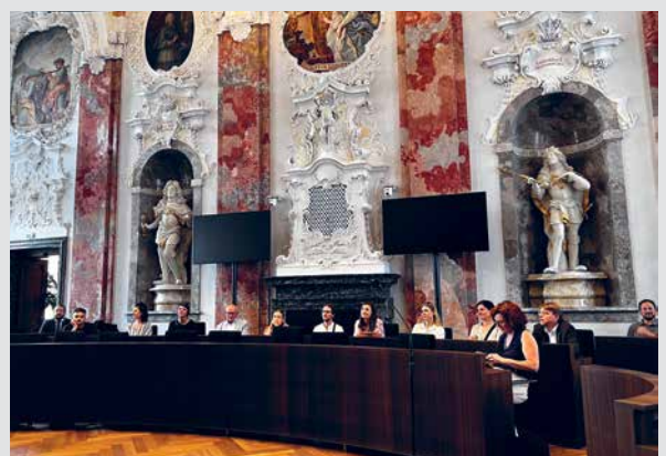
Visit to Innsbruck, Austria celebrating the 40 th anniversary of the institute