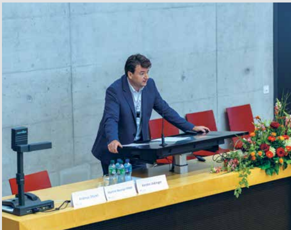
2 nd Fribourg Federalism Days

Between 2022 and 2024, the International Research and Consultancy Centre of the Institute of Federalism (IRCC) participated in the project «Power-sharing for Peace», which was funded by the Swiss Network for International Studies (SNIS).