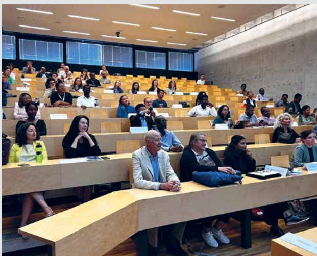
Impressions Summer University 2024

In 2024, fundraising remained a strong challenge for the IRCC: while we were able to raise some funds, for the Summer University and its Conference (SNF, Aargauer Stiftung, FDFA, SDC, Toni Hagen Foundation), for the outreach project on Webtoons (Centenary Research Fund of the University of Fribourg) and as part of the current research projects, the long-term conduct of activities will remain challenging without institutional financial support.