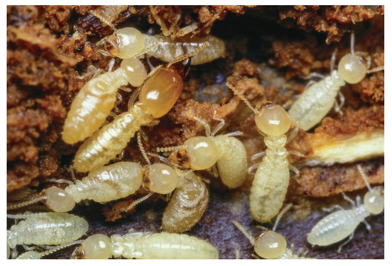
Workers of the Japanese termite ( Reticulitermes speratus ) can't repair oxidative damage as well as queens (not shown) and live shorter lives.

tor ants, also known as Indian jumping ants, lay eggs, their brain develops 40% more of a type of protective cell called ensheathing glia, Lihong Sheng, a postdoc in Bonasio's lab, reported in August 2020. A decline of these cell types is associated with aging in flies and cognition loss in mice. "If we know what the ants themselves use to control the number of [ensheathing glia] in the brains," Bonasio says, it could point to similar mechanisms in flies, mice, and "maybe in humans." (Bonasio is now studying the phenomenon in Drosophila flies; the ants "showed us the way but once I know what the pathway is, I prefer to do the experiment in Drosophila ... because it is easier," he says.)