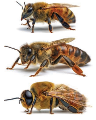
In the western honey bee (Apis mellifera), queens (middle) live longer than workers (top) and drones (bottom).

AGING, OR SENESCENCE , is a progressive loss of function and performance with time. It saps the individual's capacity to withstand stress, fight diseases, heal wounds, or learn new skills. But must we age? Why did organisms not evolve to maintain their youth-like vigor until they're about to die?