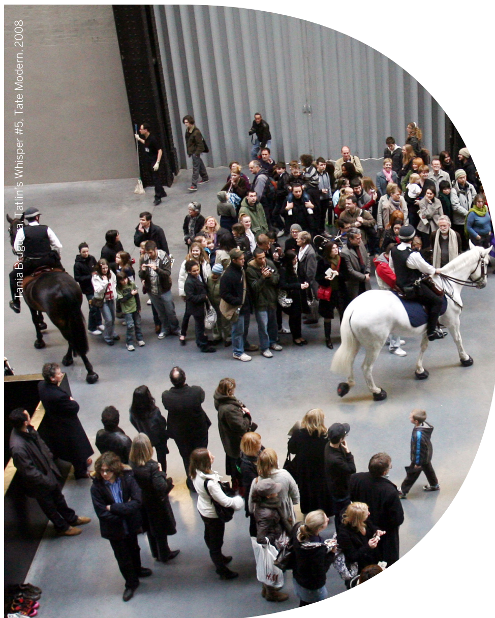
Tania Bruguera, Tatin's Whisper #5, Tate Modern, 2008

I Università Luav - - - di Venezia U - - - A - - - V