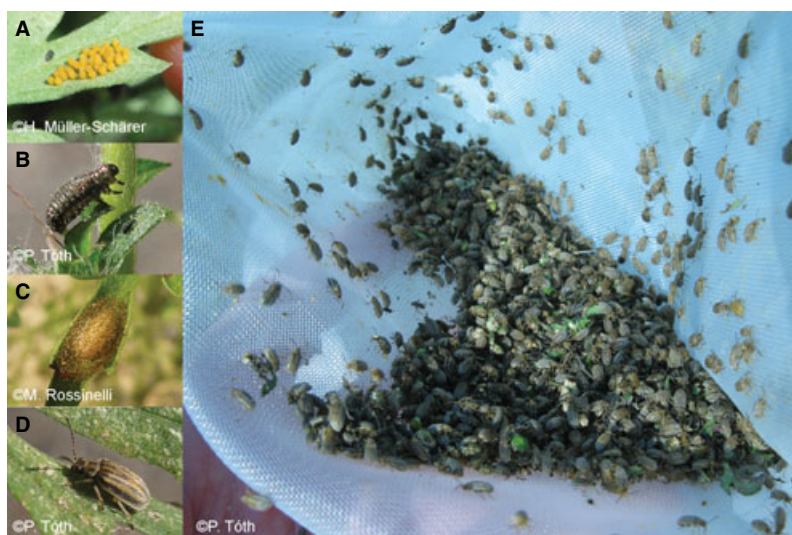
Fig. 3 Ophraella communa on Ambrosia artemisiifolia . Different developmental stages: A. Eggs; B. Larva; C. Pupa; D. Adult; and E. Thousands of O. communa in a sweeping net after 10 sweeps in a field full of A. artemisiifolia near Milano (Corbetta, 24 Sept. 2013). Adults and the three larval stages of the beetle all feed on the leaves. Based on extensive laboratory studies (Zhou et al. , 2010) and field observations (Chen et al. , 2013) on temperature dependent developmental time in China, we expect 3–4 beetle generations per year in the areas, where it is presently occurring in Europe.

Generally, the level of attack rapidly increased over time. In Switzerland, A. artemisiifolia plants with leaf beetles and leaf beetle feeding damage were first observed in mid-July 2013 in Balerna, canton Ticino. At that moment, plants were still in the vegetative or bolting phase. The damage consisted of perforated and desiccated, dead leaves (Fig. 1A). All developmental stages of the leaf beetle (Fig. 3A–D) were found to co-occur on single plants. Larvae were usually found on young leaves at the top of the plants, whereas eggs, pupae and adults were encountered throughout the plants. Incidence and level of attack strongly varied within and between sites. One month later in August, numbers of individuals per plant and incidence of attack had increased. More heavily attacked plants harboured mainly larval stages (Fig. 1B).