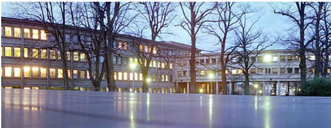
Fribourg, July 2011